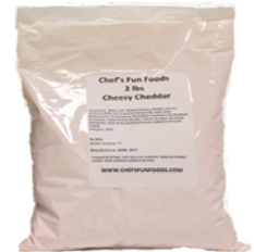
2lb Bulk Bag